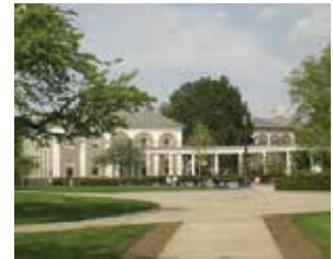
ROGER HULL PLAZA