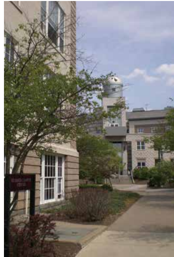
REAMER CAMPUS CENTER AND OLIN CENTER